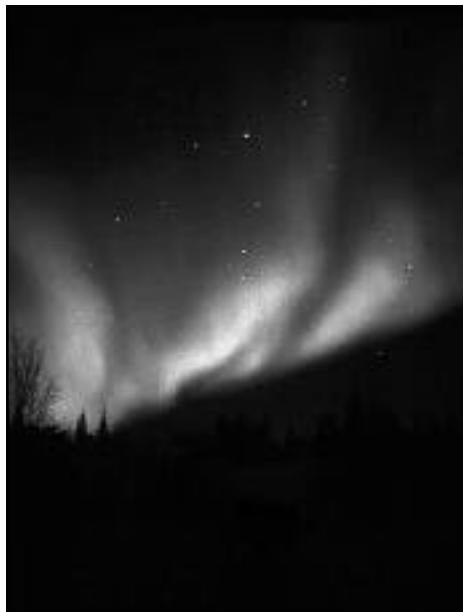
Artist's impression of anomalous glows observed after an explosion.